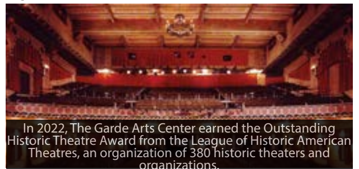
In 2022, The Garde Arts Center earned the Outstanding Historic Theatre Award from the League of Historic American Theatres, an organization of 380 historic theaters and organizations.

When we attended the walk-through with the Garde team and the other bidders, we were immediately struck by one particular challenge being highlighted for us – a beautiful domed ceiling structure which at the time was assumed would need to be cut open in order to bring in the new rigging that was being asked for as part of the upgrades. No one had any enthusiasm for this part of the job, as no one likes the idea of intentionally cutting up part of a beautiful historical architectural detail that itself was only recently restored. Unfortunately, that is often unavoidable when bringing modern technology and equipment into something originally built to handle much less ambitious lighting requirements.