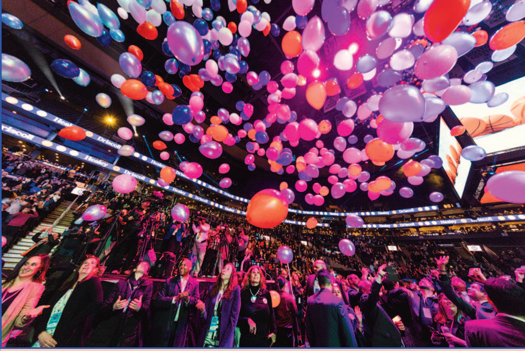
Left: Element Experiential supplied the upstage LED wall plus a pair of four-sided LED cubes, along with the screen control package and media servers. The LED panels consisted of INFILED AR Series panels. Above: A political event requires a balloon drop.