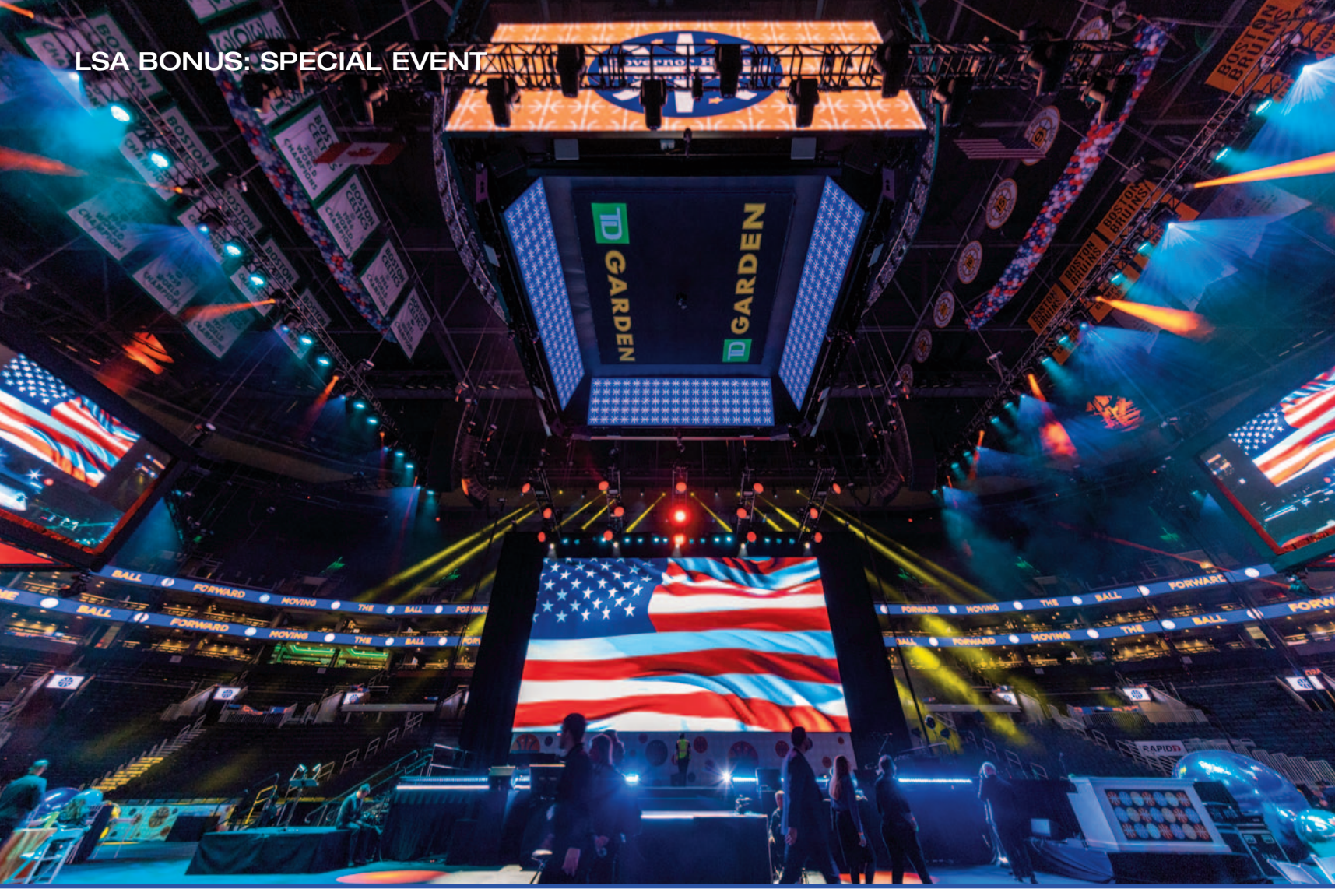
Several years ago, PORT installed a lighting system in TD Garden, mostly consisting of Robe BMFL WashBeams and Pointes. An extensive lighting package was added to provide the necessary coverage for the gala event.